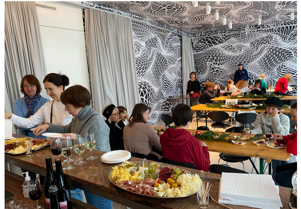
People enjoying the apero at the Kunsthaus Bar, Kunsthaus Zug, 10.12.2022