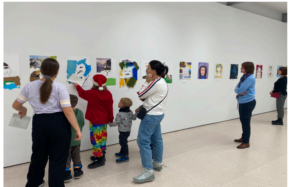
Kids showing their work to relatives, Kunsthau Zug, 10.12.2022