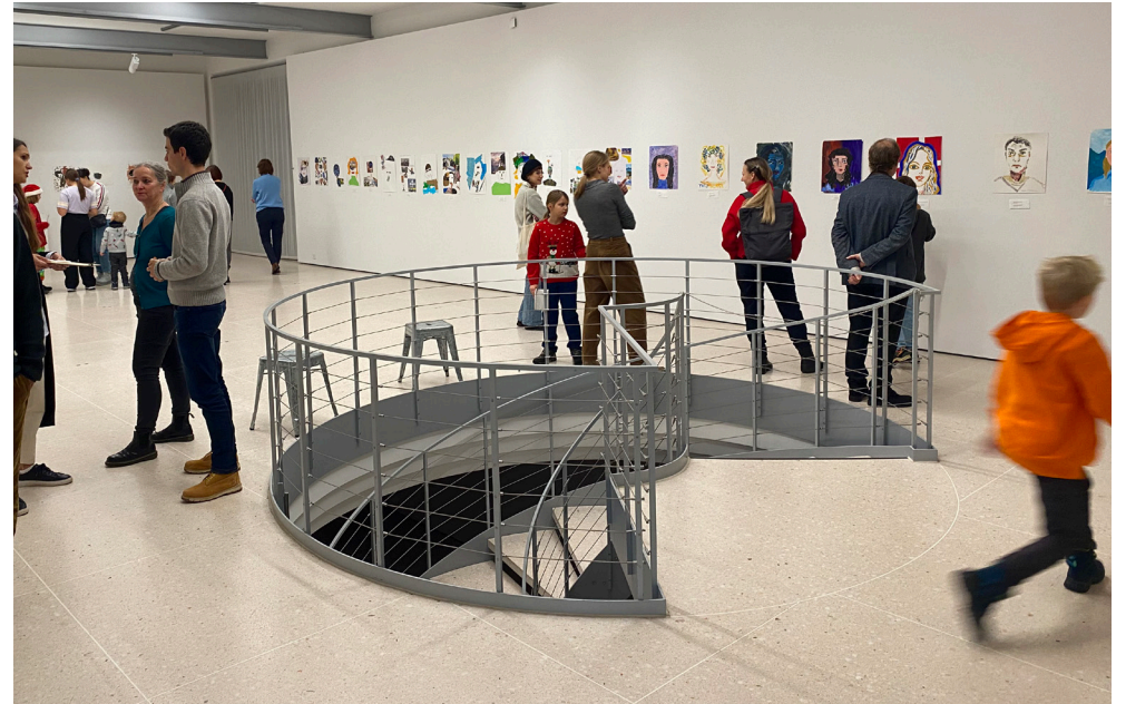
Visitors in the exhibition, Kunsthau Zug, 10.12.2022