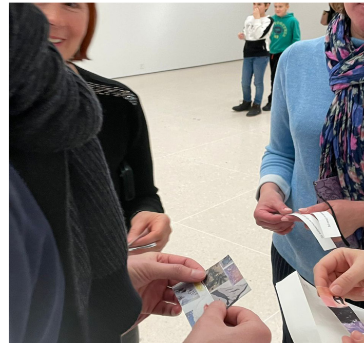
Visitors using the fragment cards, Kunsthaus Zug, 10.12.2022