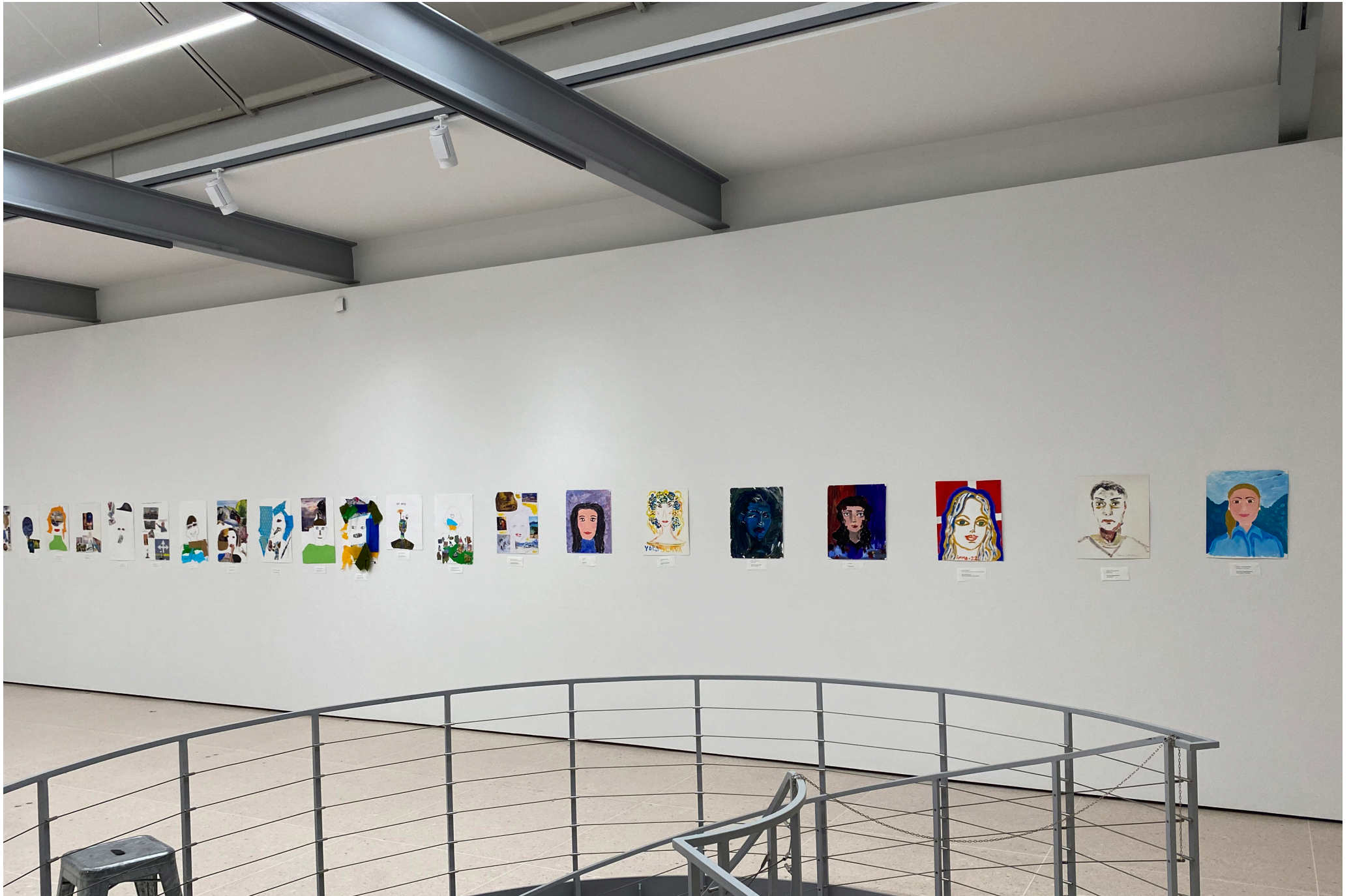
Exhibition view, Kunsthaus Zug, 10.12.2022