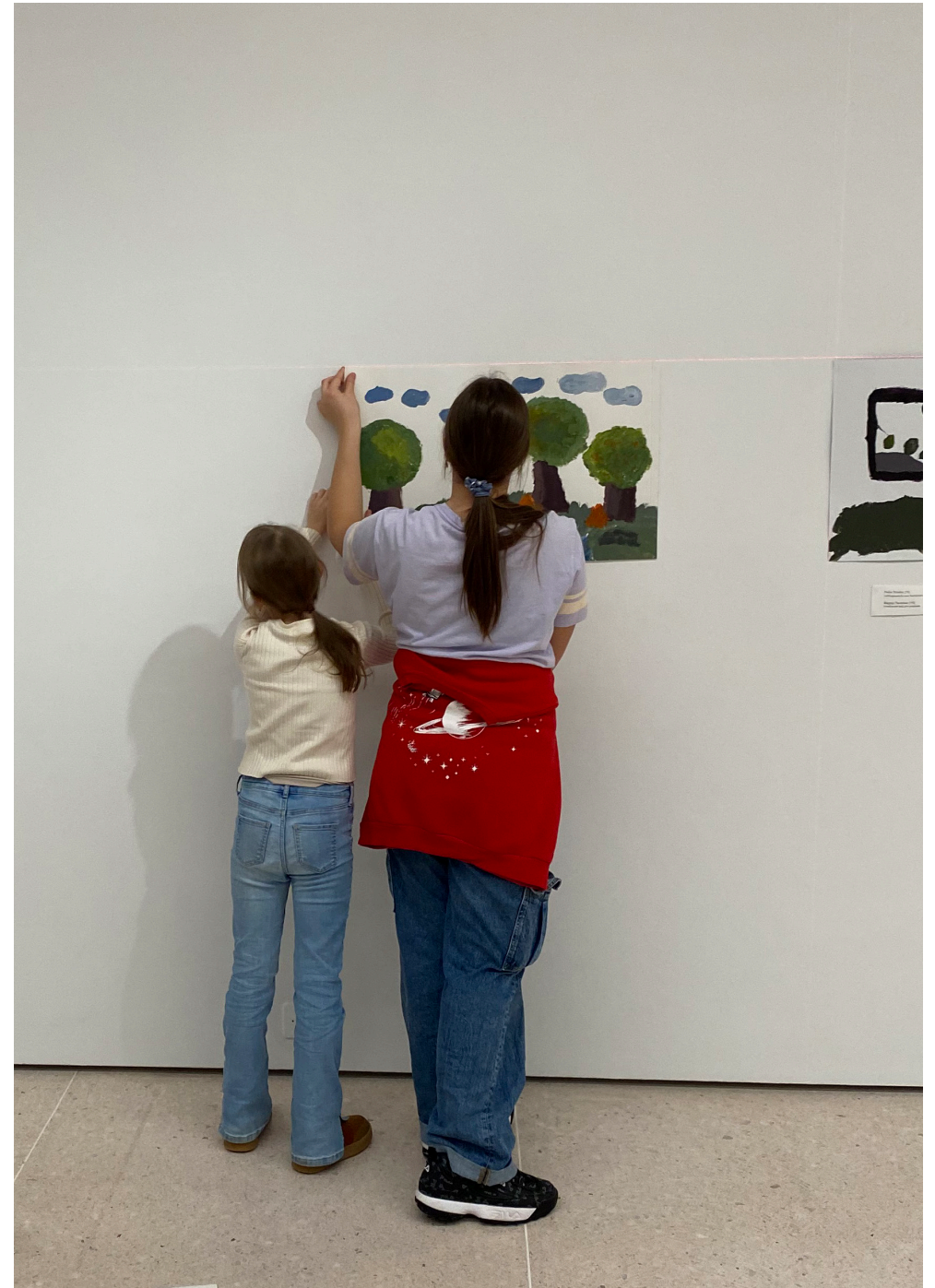
Installing the exhibition, Kunsthaus Zug, 10.12.2022