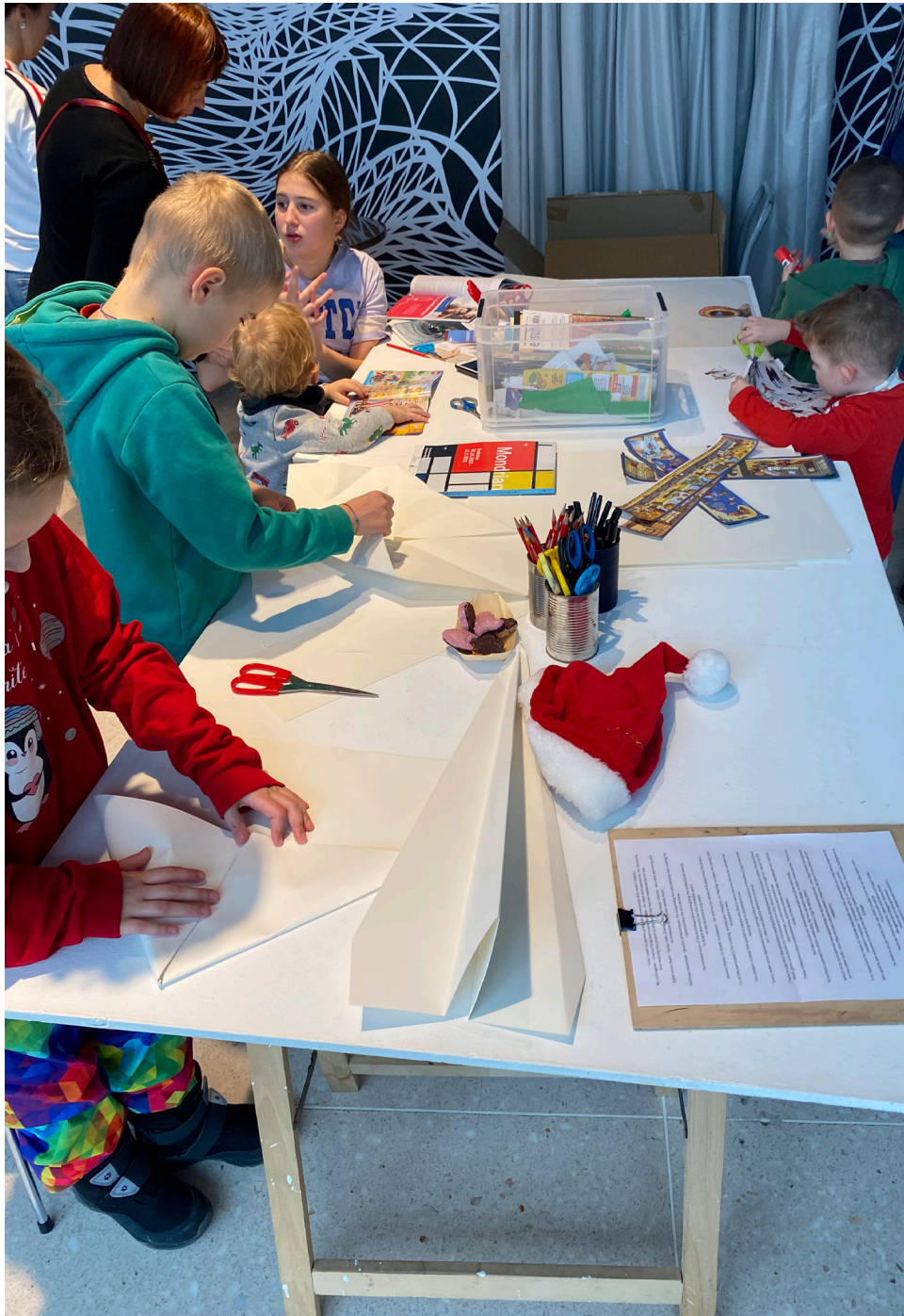
Kids at the workshop table producing collages, Kunsthaus Zug, 10.12.2022