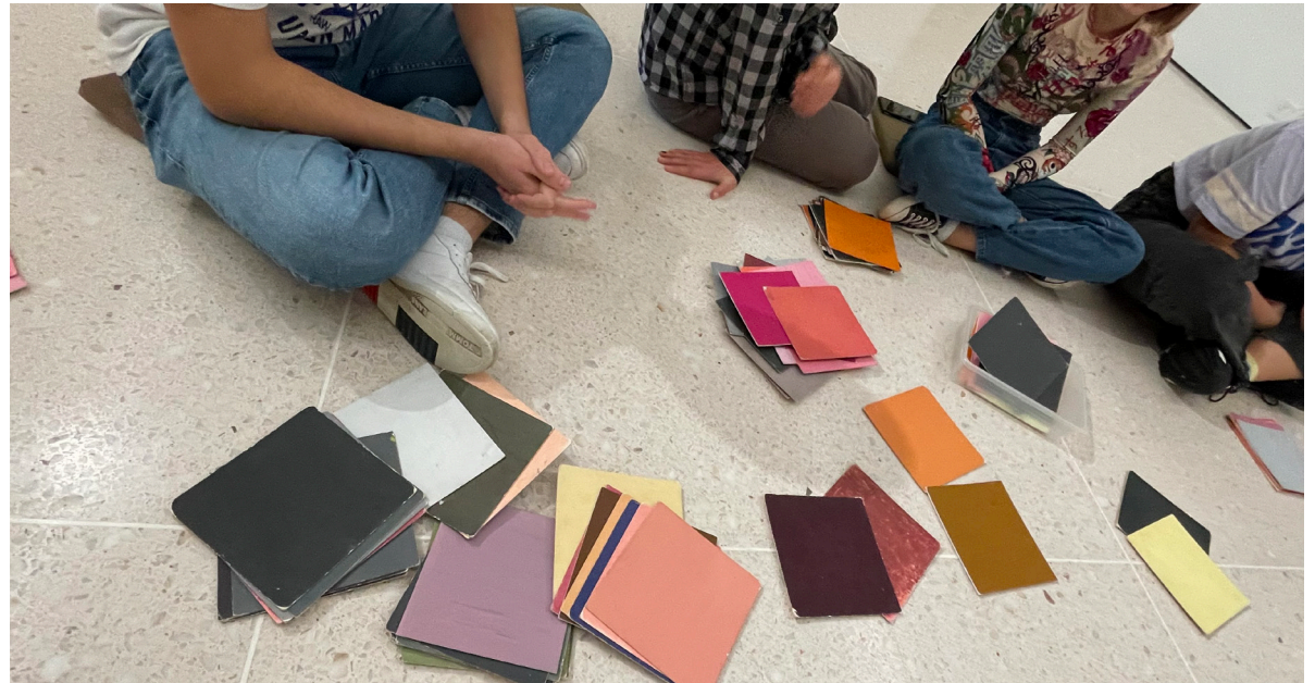
Participants discuss the colour variation in Gerstls paintings at Kunsthaus Zug, 2022

A flyer was printed and the participants invited their friends, family and community to the project presentation - also, the Kunsthaus Zug invited their members via a newsletter. The flyer was shared on social media and the homepage of Kunsthaus Zug.