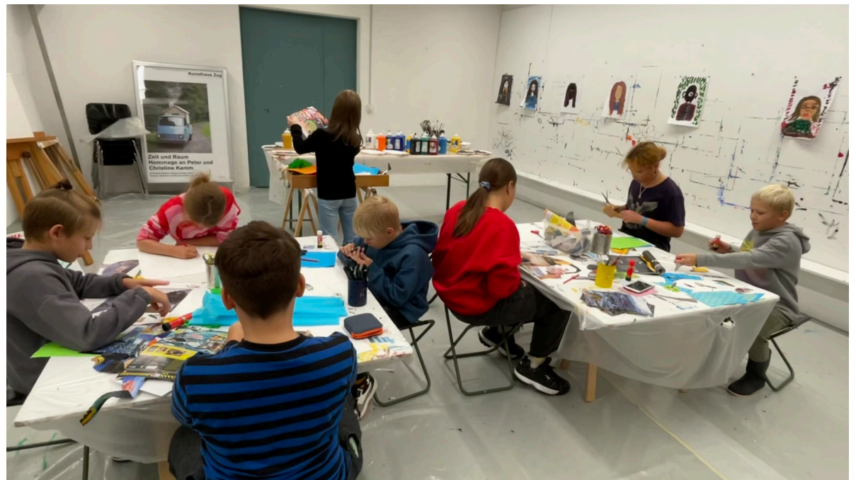
Kids and teenagers working in the workshop at Kunsthaus Zug, 2022